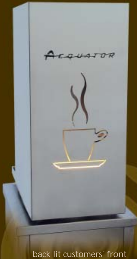
back lit customers' front

Standard machine or with extras – what you deserve is first quality! Aequator fulfils your special requirements with optional extras. Because we know that special details make all the difference.