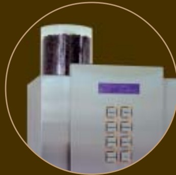
visible bean hopper (LG 22 / 26 only)