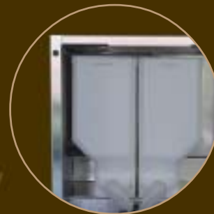
2 instant containers instead of 3 (LG 26 only)