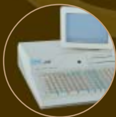
interface for cash registers