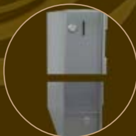
Attached housing for - coin checker - coin changer - cashless systems